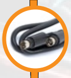
3Ft. HD Radio Cable