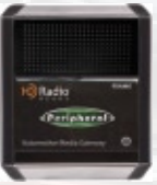
Media Gateway Part #: PXAMG