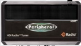
HD Radio™ Tuner (sold separately) Part #: HDRT