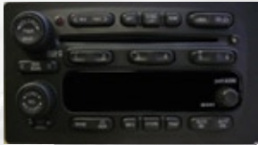
Factory Radio Not Included