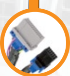
Media Gateway Harness Part #: PGHGM5