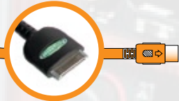
11Ft. iPod Cable